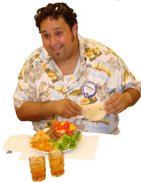
Sure can't beat the food at Club!