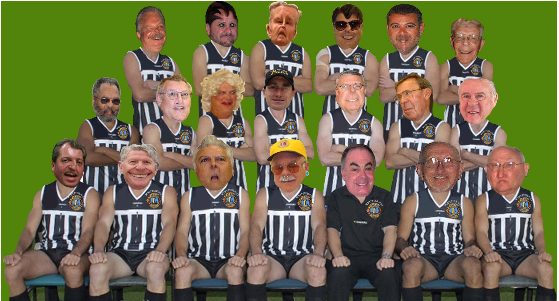
WHITTIER HOST LIONS CLUB 2007-2008 BOARD OF DIRECTORS